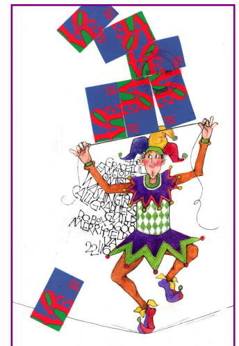
Ruth Korch - 2006