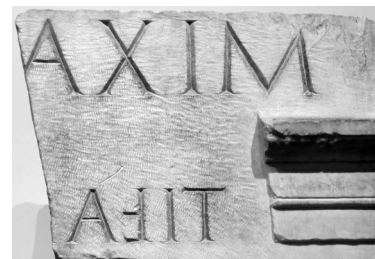
The inverted F was pronounced like a W/V to differentiate it from the vocalic U sound.

★ One of your editor's stops in Rome was at the Epigraphic Museum, part of the National Roman Museum at the Baths of Diocletian. The items are carefully selected from their collection of 10,000 inscriptions to give a walk through Roman inscriptions from scratches on pottery to informal wax tablets to some majestic Roman caps, with enough enlightening didactic material along the way to keep non-calligraphers from bolting. I was particularly intrigued by this inscription; the inverted F looked like drunken stonecutting but turned out to be one of three letters that the emperor Claudius introduced to make spelling more clear. It had the consonant sound of W/V; the letter V sounded 'oo'. Some experts think that the upside down F shape was used so the letter carvers could use letter templates that already existed. Another Claudian letter looked like a backward C and represented the PS/BS sound, just as X represented KS/GS. The reforms were scrapped after Claudius' demise.