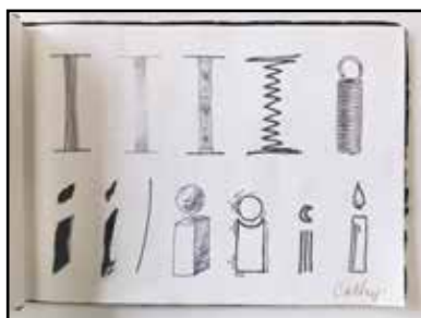
Julie's examples on creating the Letter 'T'