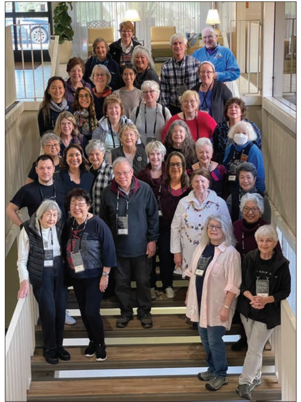
Friends of Calligraphy members who attended Letters California Style 2024 at the Kellogg Conference Center adjacent to the Cal Poly Pomona Campus, Pomona.