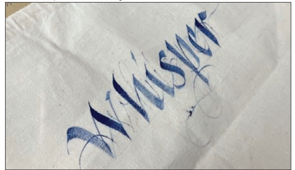
Ed Fong's practice on fabric using a flat brush and EZ-A pen.