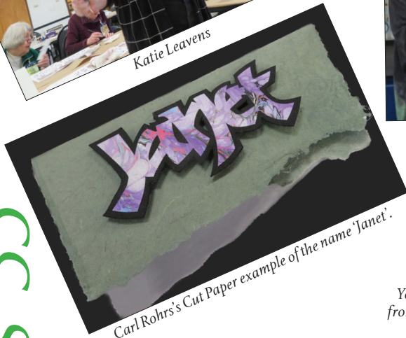
Carl Rohrs's Cut Paper example of the name 'Janet'.